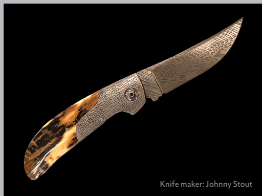
Knife maker: Johnny Stout

”I selected one of my existing folder models, plus, I created a new model for the project. I mixed the two new Damasteel patterns on each knife, choosing one pattern for the blade, and the other pattern for the bolsters. By building the folders with this new material, it gave the opportunity to be creative and showcase the steel patterns in ways that had not been seen before.